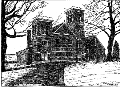
Hebron Presbyterian Church

Adult Bible Study: Friday morning, 10 A.M.